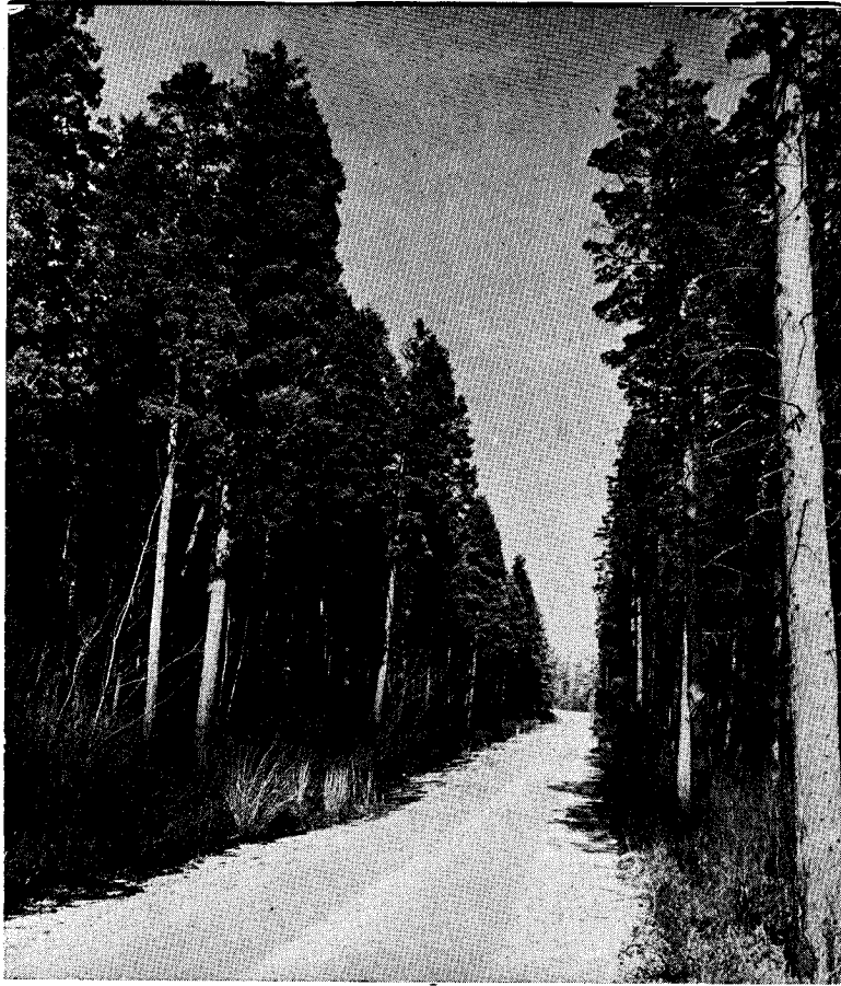
Cedar Swamp on Shinns Branch