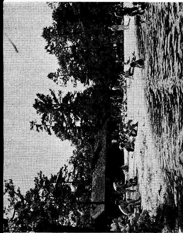
Bathing Beach — Pakim Pond

The white cedar ranges from Maine, southward along the Coast to Florida. It is one of the most characteristic trees of the Pine Barrens where it reaches the northern limit of commercial importance. The wood is light, soft and rather durable. These qualities recommend it for a wide variety of uses and include boat building, shingles, fence posts, stakes and rustic furniture.